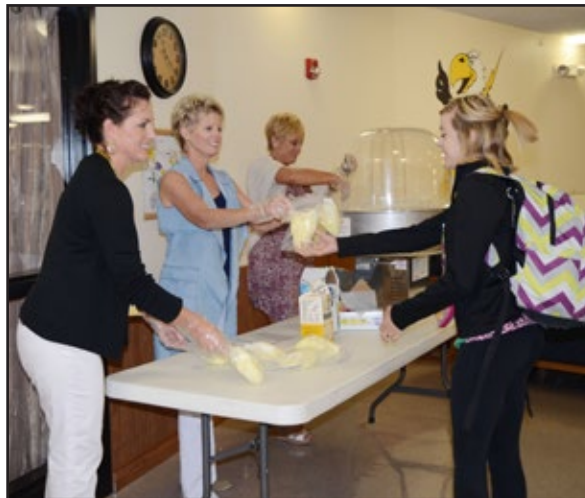
Students were treated to cotton candy with the VPs the second week of classes.