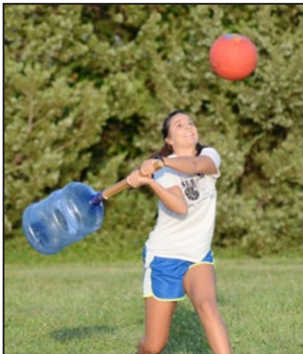
Extreme Wiffle Ball was moved to Thursday, Aug. 25, also because of rain.