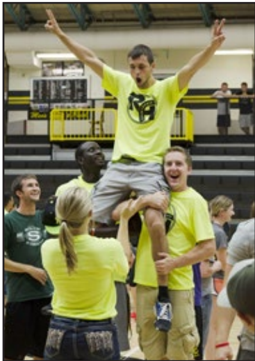
At the Play Fair on Saturday, Aug. 20, students played games and listened to a speaker, all in an effort to get to know one another.