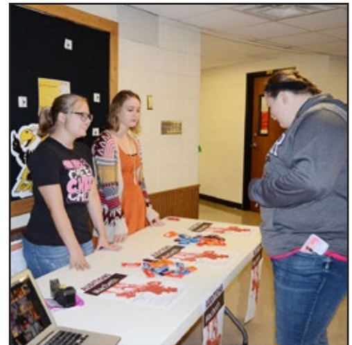
Students checked out the various clubs and organizations at the Club Fair on August 31.