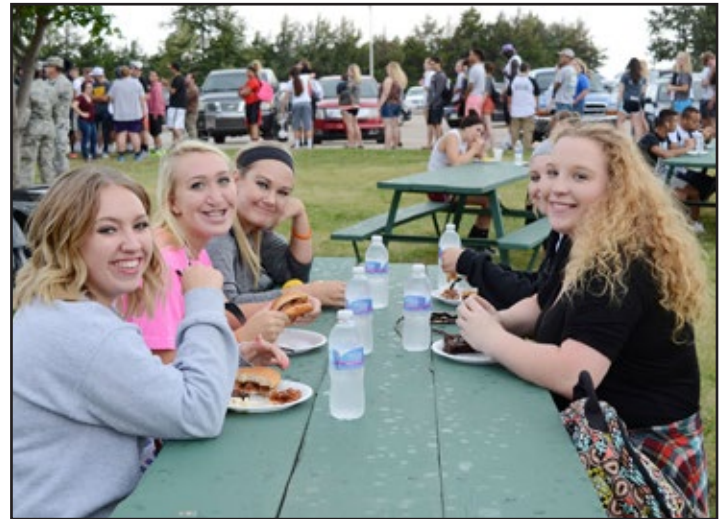
The Back to School BBQ was short-lived on Tuesday, Aug. 23. The event was moved inside because of severe weather. Tuesday was the first day of classes, and students also had their pictures taken with Thor.