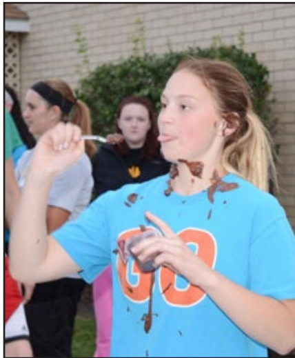
At messy night, on Monday, Aug. 22, students played Messy Twister, had a pudding fling, a paint Slip 'N Slide, and several other less than clean activities.