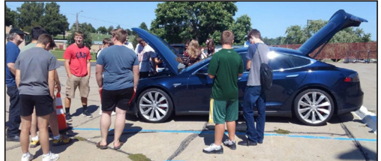
The Renewable Energy Department was host to a national Drive Electric event on Sept. 10. Those who attended had the opportunity to drive an electric car, as well as learn more about them.

student at CCCC and recipient of the Ernest G. and Ellen E Briggs Memorial Scholarship thanked the donors for her ability to further her education and pursue her dreams without having to pull out any loans.