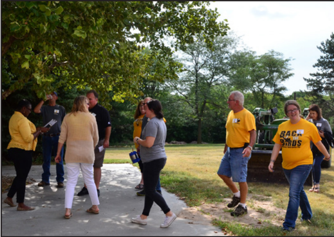
At Cloud's first ever Fall Convocation, all employees participated in a scavenger hunt that led them all around campus.